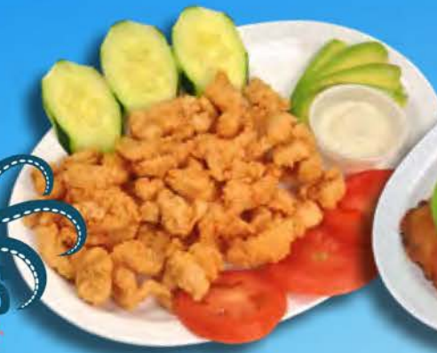
Chicharrón de Pescado 15 99 Fish crackling