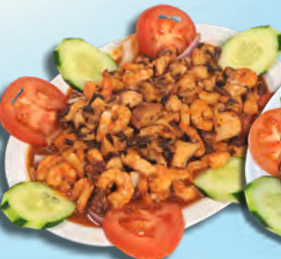
Chapuzón del Mar Shrimp, octopus & scallops in our special red mild sauce Sm 34 99 Lg 59 99