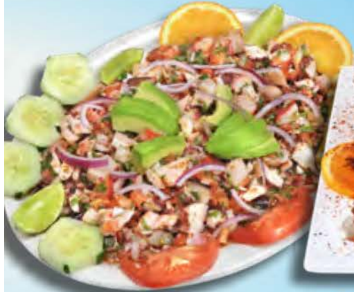
CEVICHEs Ceviche de la Casa 21 99 Fish, shrimp, octopus, abalone, scallops, oysters & surimi ceviche Ceviche de Pescado 16 99 Fish ceviche Ceviche Mixto 17 99 Fish & shrimp ceviche Ceviche de Camarón 19 99 Shrimp ceviche