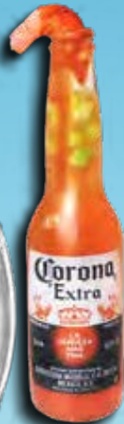
Huichola 6 99