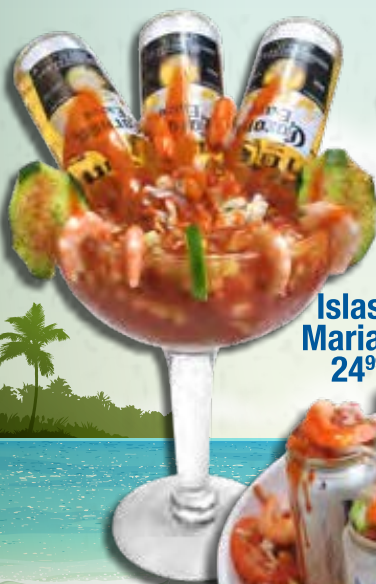
Islas Marias 24 99