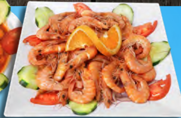
Camarones al Vapor 29 99 Steamed shelled shrimps