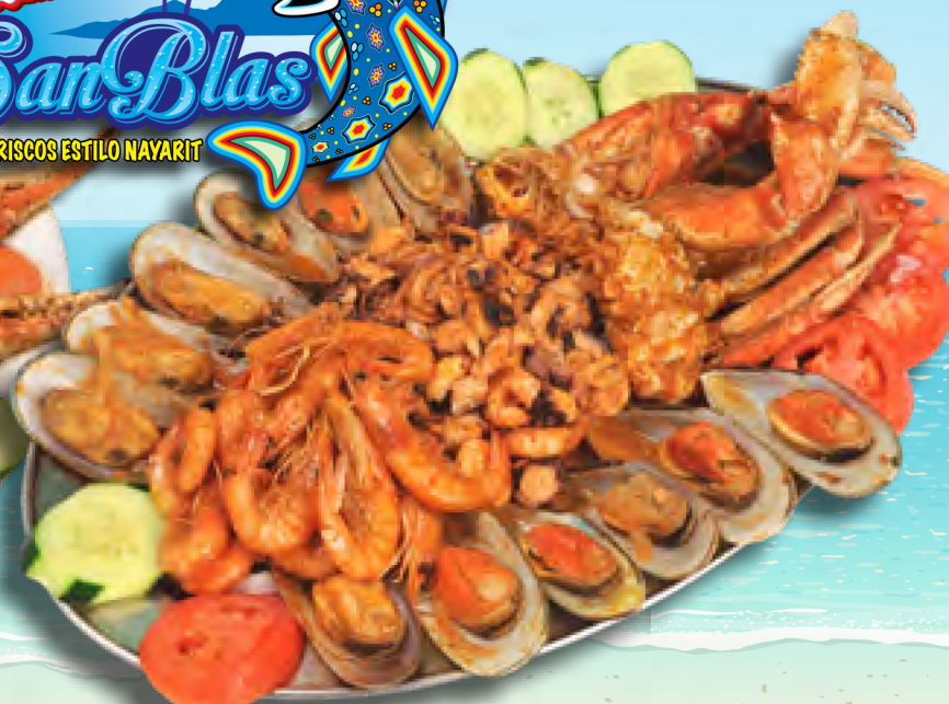
Charola Levantamueertos Mixed seafood: crab legs, mussels, shrimp octopus & chapuzón del mar Sm 41 99 Lg 63 99