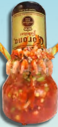
Caguamazo 19 99