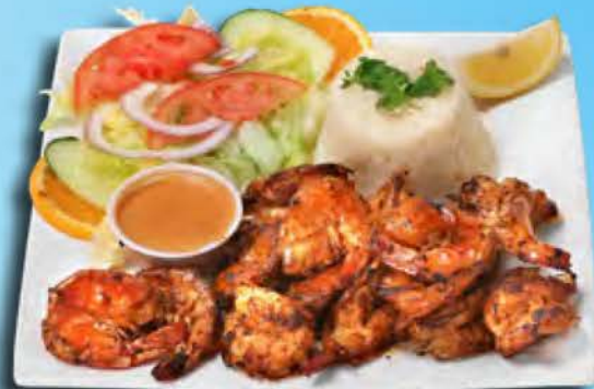
Camarones Monkeys 21 99 Grilled shirm in our-house sauce HOT!

Shrimp marinated in lime juice & house-made mango habanero sauce