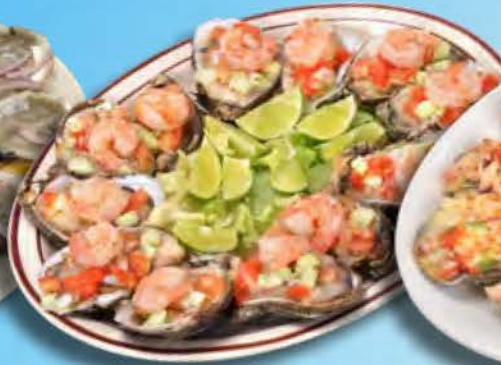
Ostiones Preparados Oysters topped with shrimp & octopus 1/2 Doz 19 99 Doz 28 99