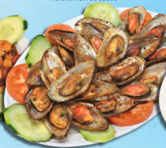
Charola de Mejillones Mussels (Hot!) Sm 19 99 Lg 32 99