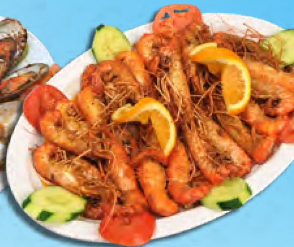
Langostinos Prawns with our house red sauce Sm 29 99 Md 49 99 Lg 72 99