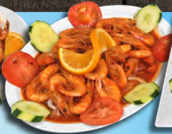
Camarones Cucaracha 29 99 Deep fried shrimps with our Huichol hot red sauce