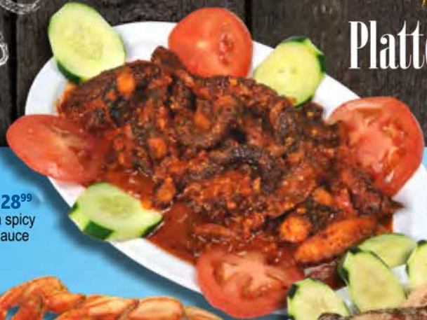
Pulpo Enojado 28 99 Octopus stripes in a spicy guajillo & huichol sauce