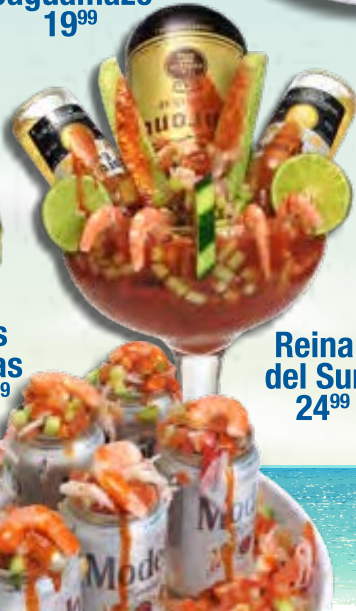
Reina del Sur 24 99