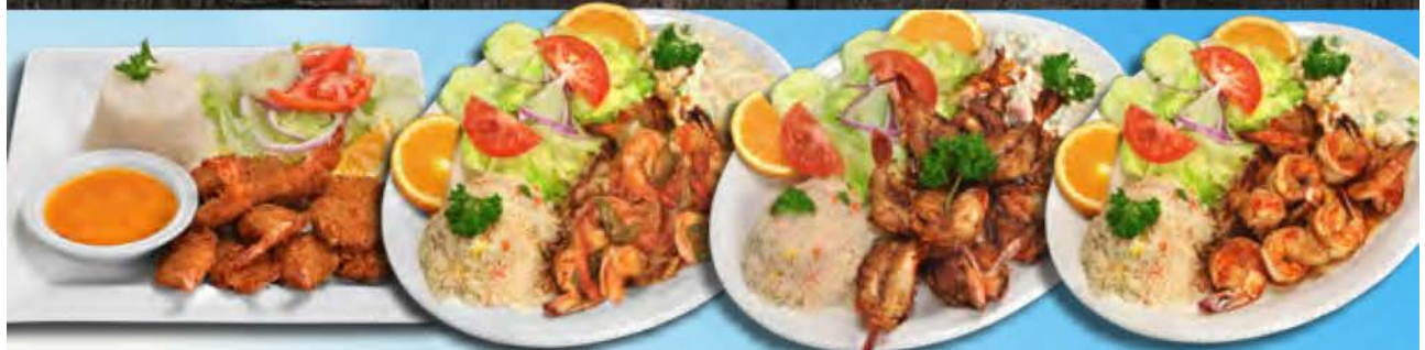
Camarones Empanizados de Coco en Salsa de Mango 19 99 Coconut shrimp with mango sauce