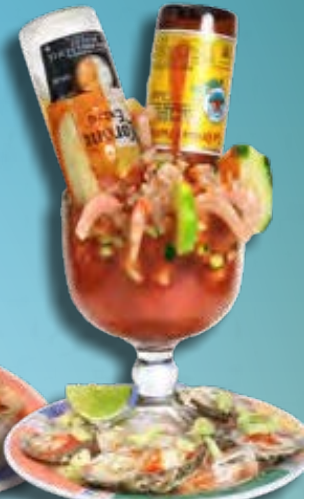
Novillero 18 99