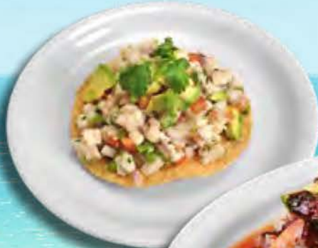
Tostada de Ceviche de Pescado