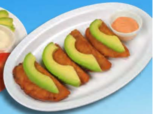
Empanadas de Camarón Shrimp pastries (4) 9 99 (8) 17 99