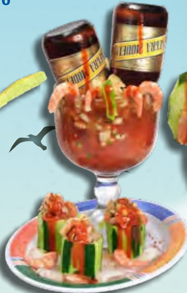
Cuata 17 99