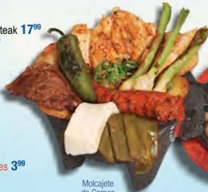
Molcajete de Carnes

Mixed seafood fajitas: shrimp, octopus, crab and scallops