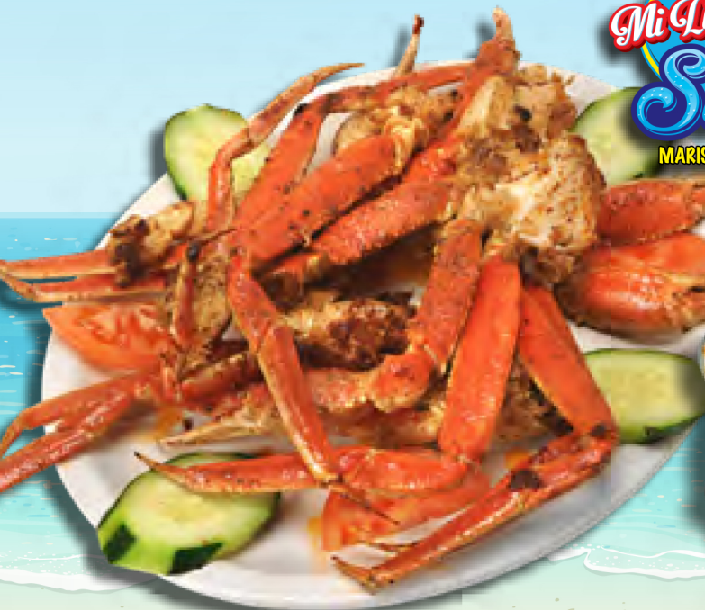
Patas de Jaiba 39 99 Crab legs with our house red sauce