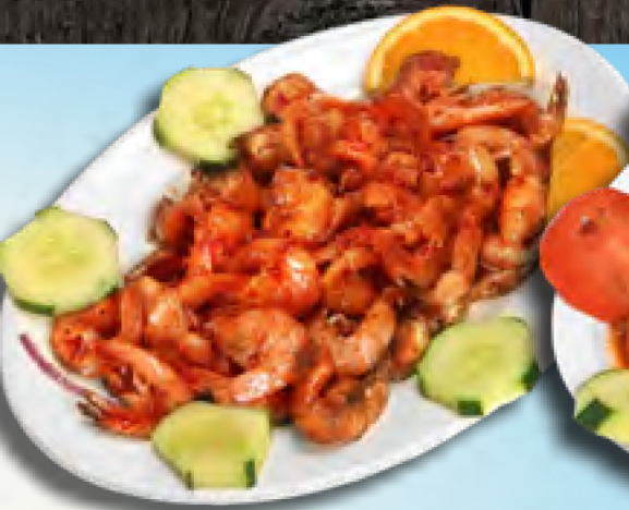
Camarones Coras 30 99 Shrimp with our hot spicy Cora style