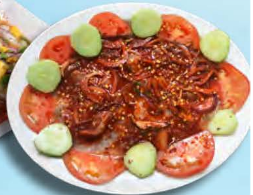
Camarones Aguachile Rojo 19 99 Shrimp marinated in fresh lime juice, salt, chile de arbol and guajillo chile