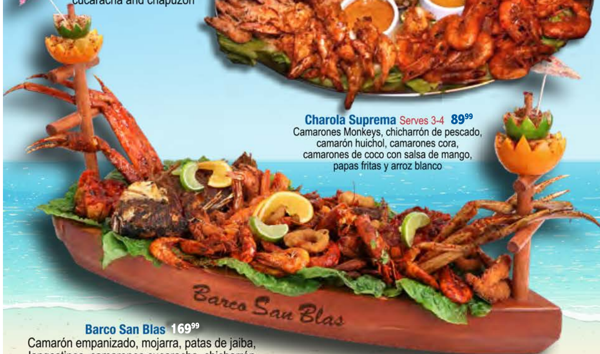
Barco San Blas 169 99 Camarón empanizado, mojarra, patas de jaiba, langostinos, camarones cucaracha, chicharrón de pescado y camarones monkey