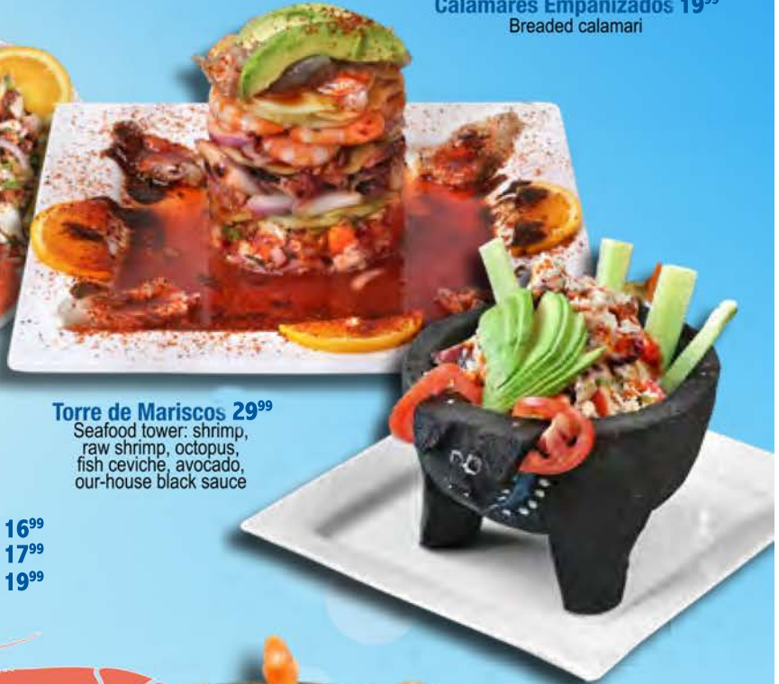
Torre de Mariscos 29 99 Seafood tower: shrimp, raw shrimp, octopus, fish ceviche, avocado, our-house black sauce