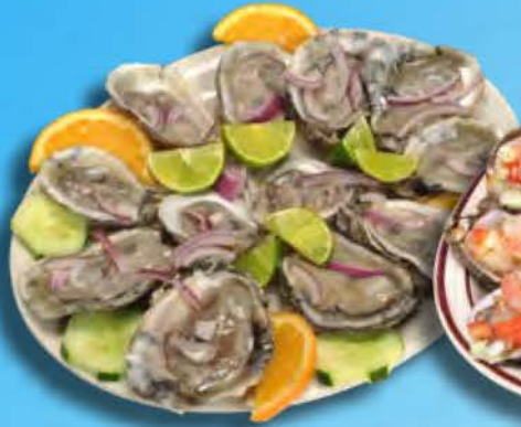
Ostiones en su Concha Raw oysters in their shell 1/2 Doz 17 99 Doz 24 99