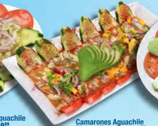
Camarones Aguachile Mango-Habanero 20 99 Raw shrimp marinated in lime juice & our delicious mango-habanero sauce