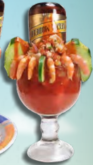
Chapita 12 99