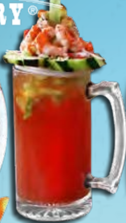
Botanera 10 99