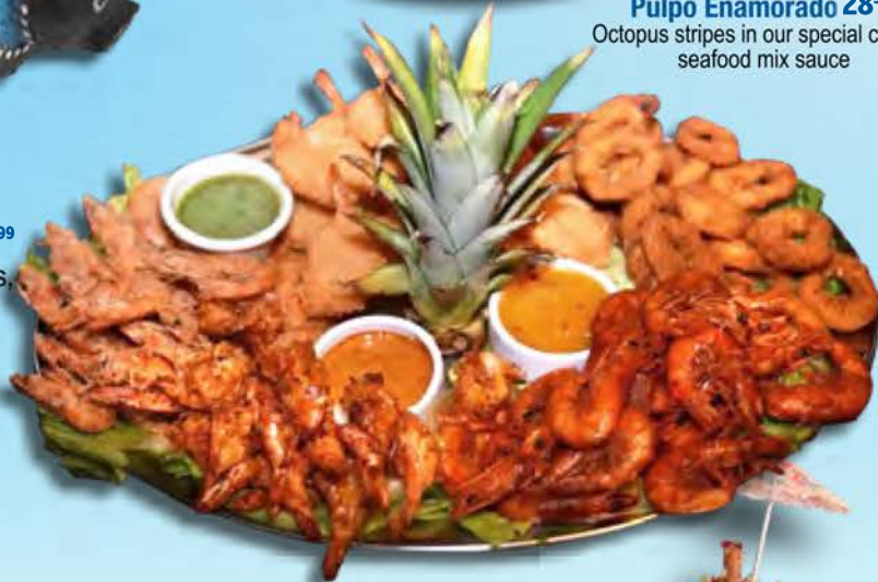
Charola Suprema Serves 3-4 89 99 Camarones Monkeys, chicharrón de pescado, camarón huichol, camarones cora, camarones de coco con salsa de mango, papas fritas y arroz blanco