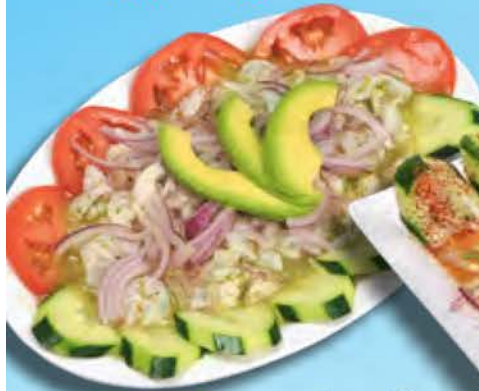
Camarones Aguachile Verde 19 99 Shrimp marinated in fresh lime juice, salt, green tomatillo, onion, serrano pepper sauce