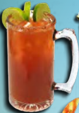
Tropical 7 99