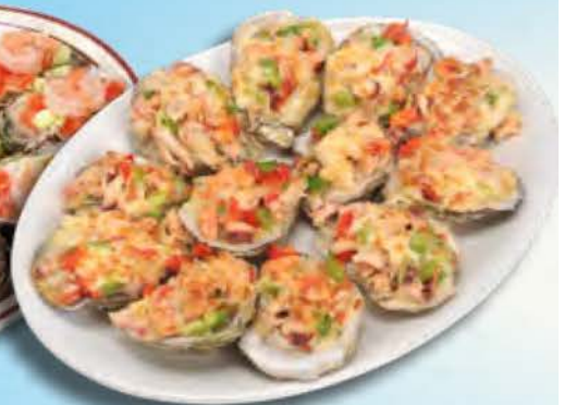
Ostiones Gratinados Oysters w/ shrimp, octopus, green peppers & melted cheese 1/2 Doz 20 99 Doz 29 99