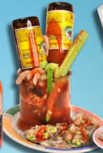
Korita 17 99